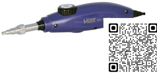
DI-1000 Fiber Inspection Scope (USB Operation)